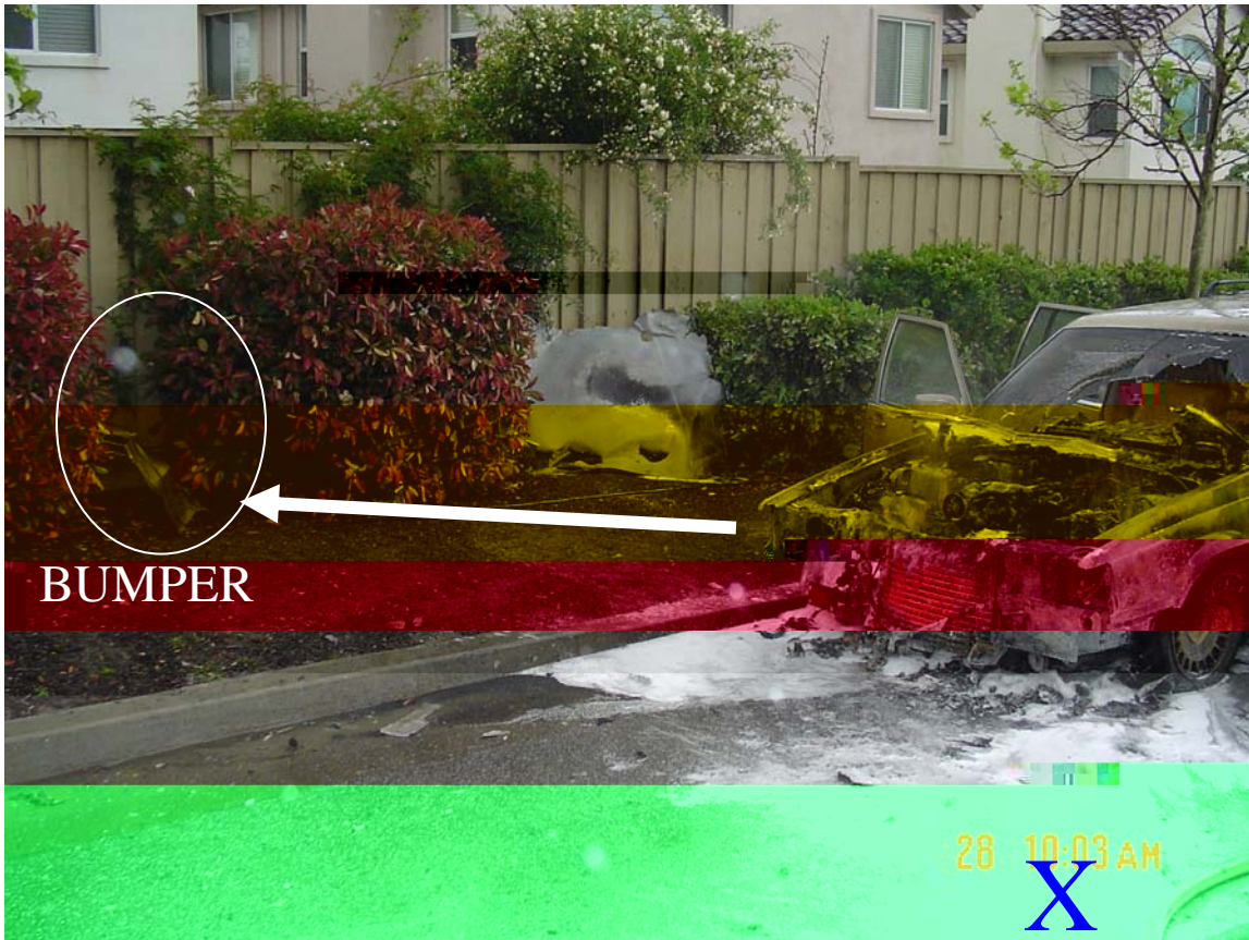
X Location of Salinas Rural Personnel at the time of failure.